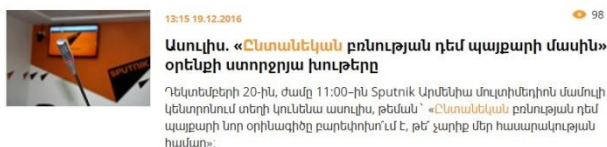
Publications against the law on domestic violence on “Sputnik Armenia” website

December 22 session. When Sputnik Armenia was informed about it (Russian FSS’s possible help here cannot be ruled out), they carried out preventive propaganda.